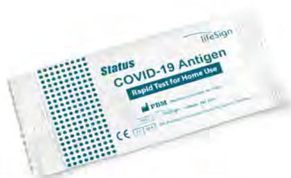
1 Test in foil pouch

Have these items ready before starting a test *