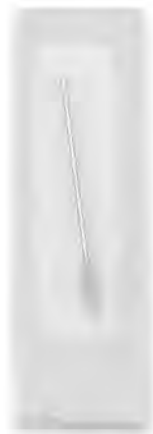
1 Swab in wrapper